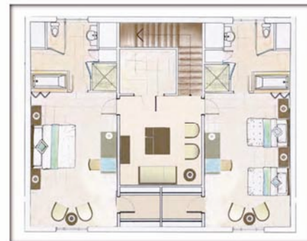
TYPE C UPPER LEVEL