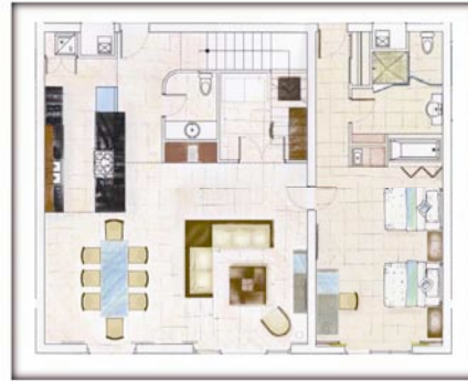
TYPE C UPPER LEVEL